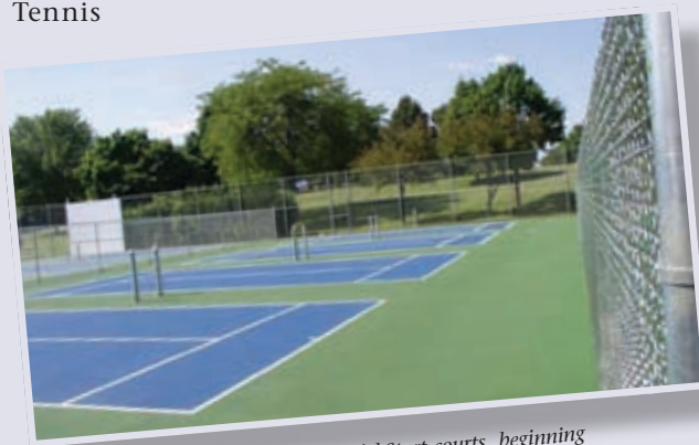
After: With 8 new QuickStart courts, beginning players will keep these courts busy.