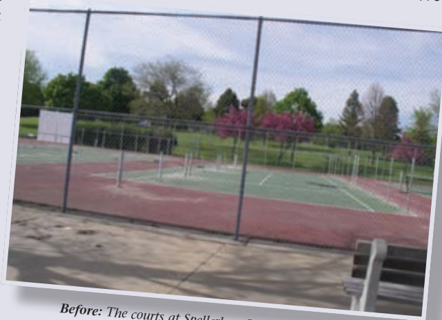
Before: The courts at Spellerberg Park were rarely used.